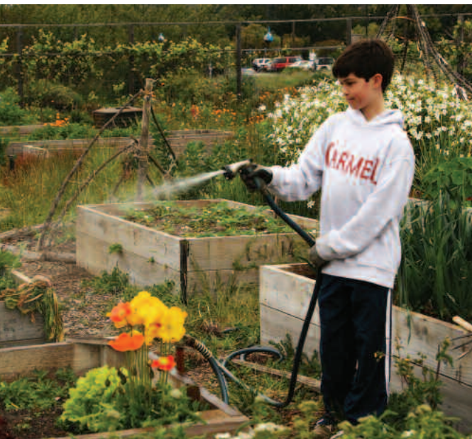
Alicia Dickerson/Life Lab

At some schools, only one site will be available. However, if that is the case, you should still perform the site analysis because it will help